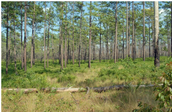
Figure 3. Fire-maintained longleaf pine-wiregrass savanna.

suppression have contributed to the decline of the longleaf pine ecosystem throughout its range. The distribution of this ecosystem has been reduced by as much as 98%, and much of the longleaf pine-wiregrass habitat that remains is in poor condition. As a result of this habitat loss and degradation, many wildlife species associated with longleaf pine savannas have also declined, including the gopher frog and gopher tortoise.