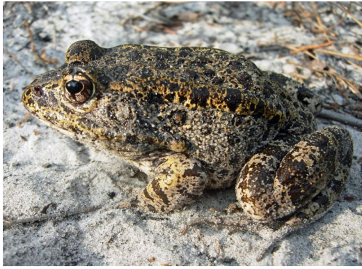
Figure 1. Adult gopher frog ( Lithobates capito ).

(for more information, read "Ecological Engineers: Pocket Gophers are one of Nature's Architects" – http://edis.ifas.ufl.edu/UW285 ). Stump holes, spaces left by decaying roots of dead trees, are also important for shelter.